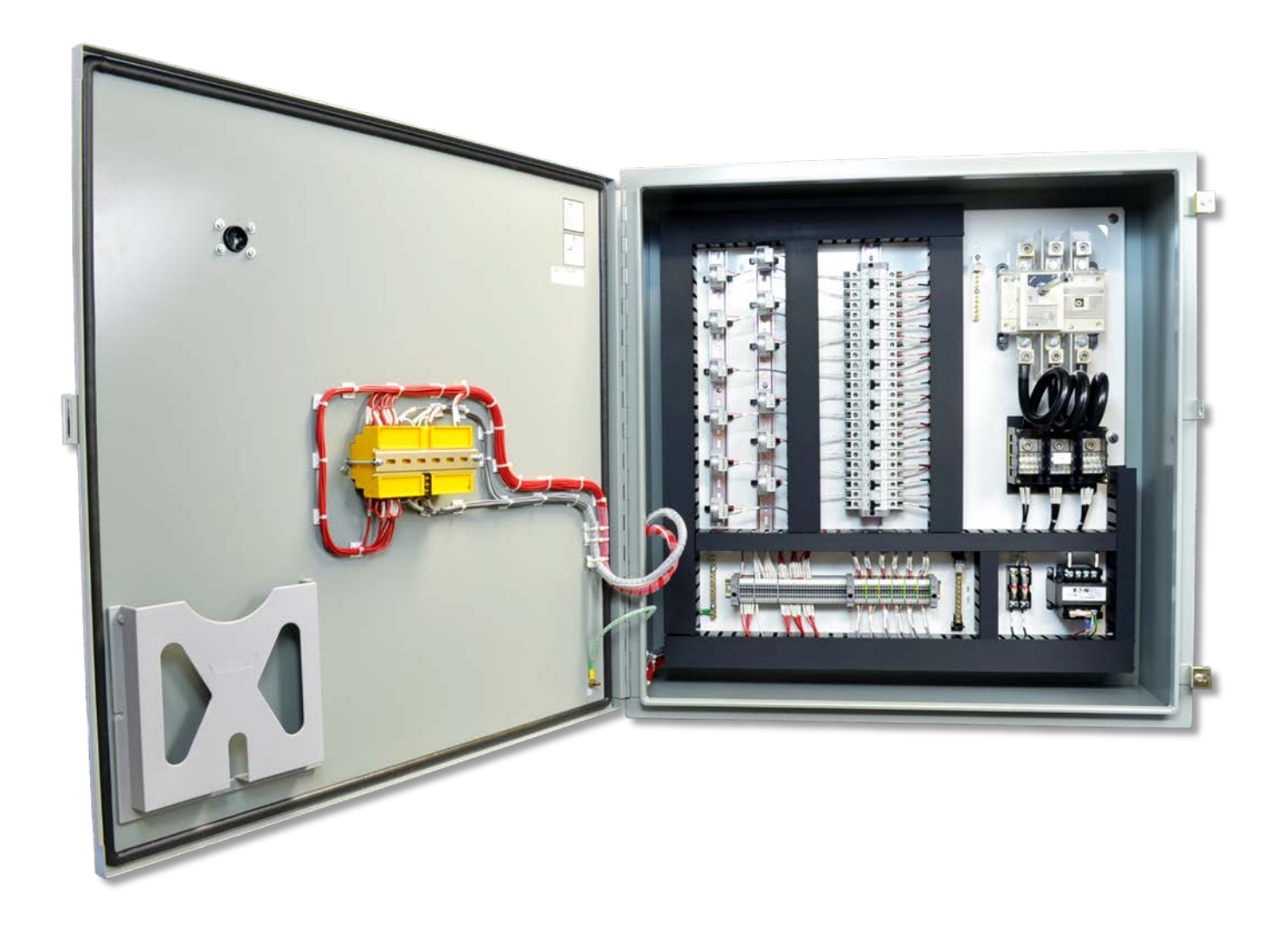
Figure 2 - Interior view of ProCS<sup>™</sup> with microprocessor relay